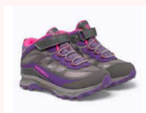
Waterproof walking shoes